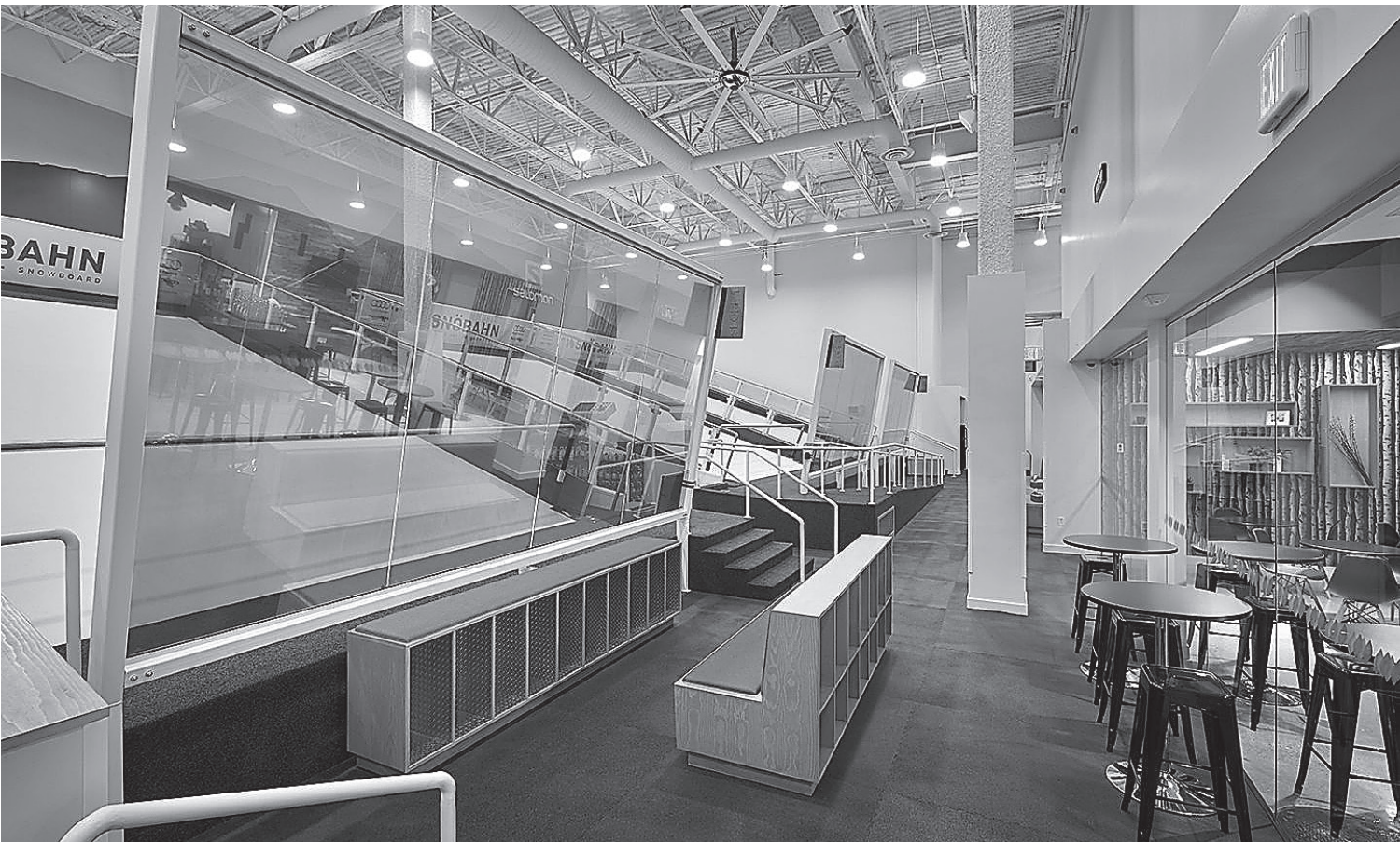
The ‘slopes’ at SNÖBAHN.

To book your next adventure, visit SNÖBAHN online at www.snobahn.com . You can also call 303-872-8494 or email the team at team@snobahn.com.