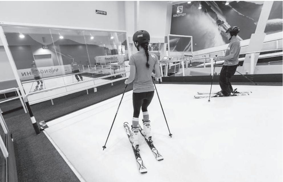
Get ready to hit the slopes! The facilities three revolving snow-like slopes help train and entertain skiers and boarders of all levels and abilities.