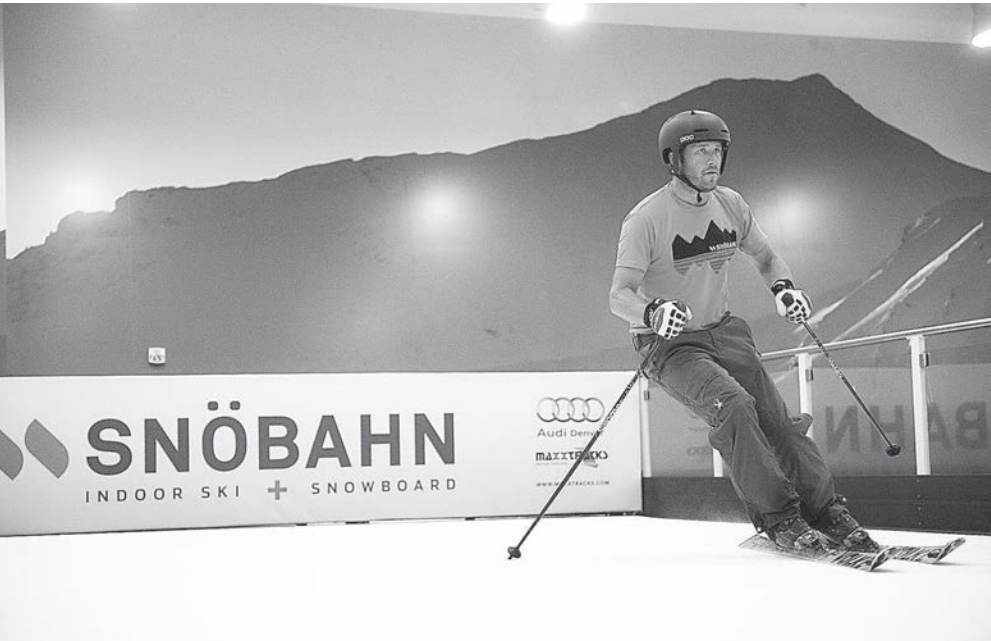
SNÖBAHN brings mountains to the metro, as well as Olympians! Olympic alpine ski racer and gold medalist Bode Miller hits the ‘slopes’ at SNÖBAHN.