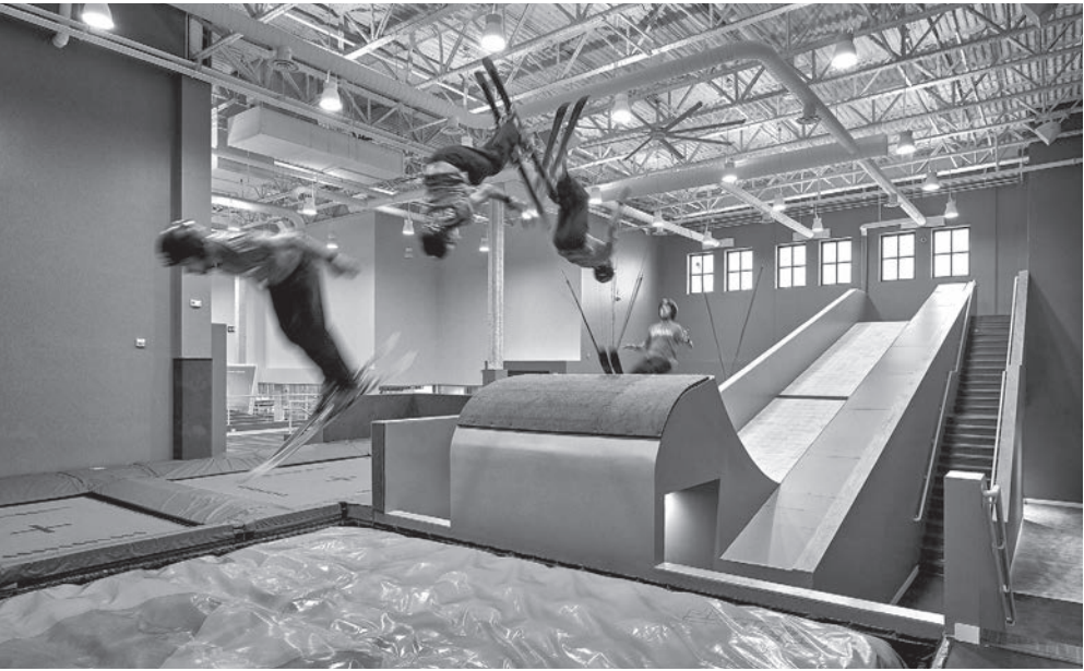
“Ramp it up”! SNÖBAHN also offers participants a one-of-a-kind mega ramp into an air bag.

Since re-opening their doors in early July, participants can expect a few changes to the facility and operations. In addition to new services, SNÖBAHN will adhere to strict safety protocols and procedures to keep all participants safe, which includes all staff be required to wear masks at all times within the facility except during participation in activities (lessons, trampolines, ramp and skate) and more rigorous and frequent cleaning protocols. The team respectfully requests that attendees use their discretion to limit the number of people watching lessons