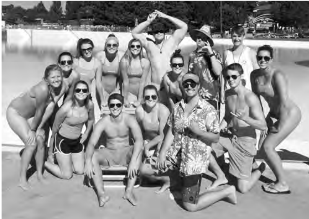
The Ken-Caryl Ranch lifeguards finished in third place at the 30th annual Colorado Parks & Recreation Association Lifeguard Games at Water World on July 12.

The mission of the Lifeguard Games is to promote professionalism, enhance skills, improve physical fitness and build teamwork in lifeguard staffs through a fun and competitive atmosphere. The teams competed in several different events: medley relay, multi-victim rescue relay, spirit challenge, rescue-tube relay, inner-tube relay and back boarding. Congratulations, Ken-Caryl Ranch lifeguards!