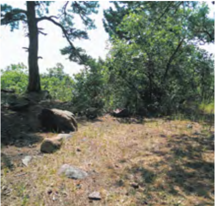
Camping in the Open Space