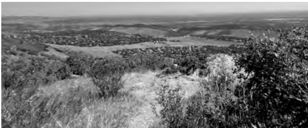
A campsite offering spectacular views is available near the east end of Gothic Overlook Trail.