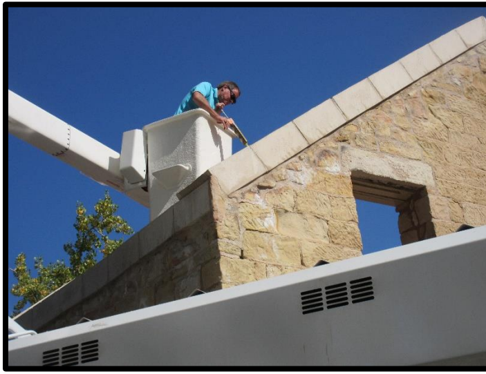
Chris Pacetti applies caulking to cracks in the bond beam.