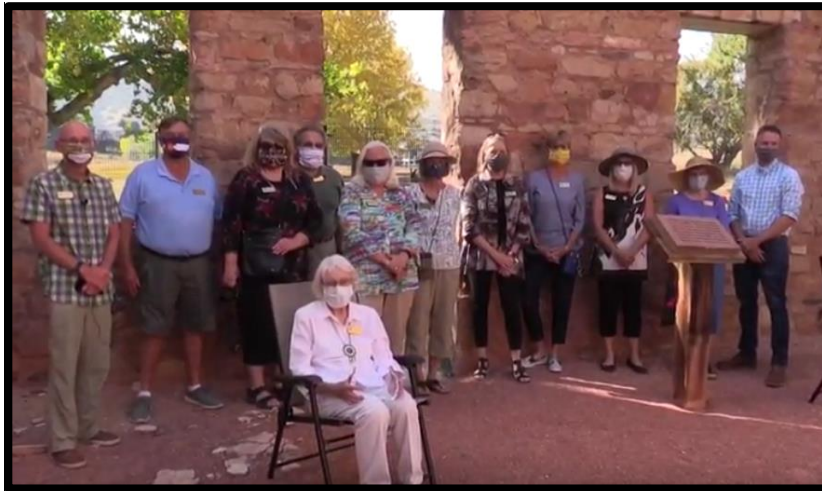
KCRHS members at the award ceremony.

Bradford-Perley House on October 10. The ceremony was recorded and may be viewed on YouTube https://www.youtube.com/watch?v=ptW57Emuc8s .