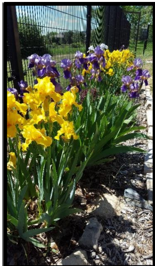
A view of the Bradford-Perley House garden, along the fence at the front of the house. Photo taken June 2020.