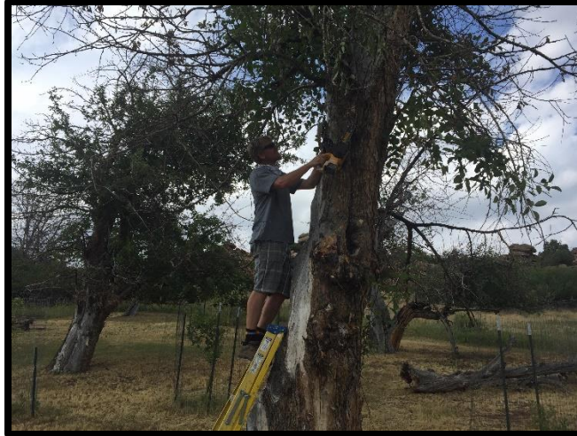
Volunteer Tim Berg assists in trimming the apple trees.