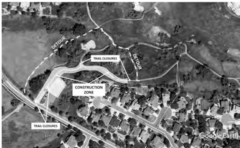
MAP OF CONSTRUCTION ACTIVITIES FOR HARD SURFACE TRAIL IMPROVEMENTS IN BRANNON GEARHART PARK. PROJECT TO BEGIN LATE SEPTEMBER 2019