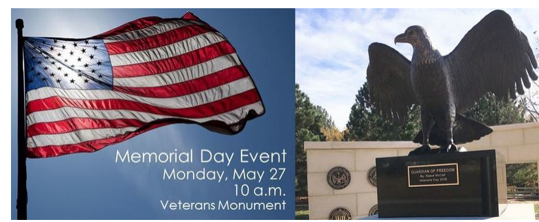
Memorial Day Event Monday, May 27 10 a.m. Veterans Monument