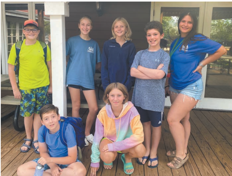
Tomorrow's leaders who took part in Leadership Camp this summer at the Ranch House.

If this camp sounds exciting to you or your pre-teen, be sure to check out our camp offerings for next year!