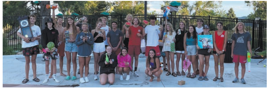
The 2022 Lifeguard Olympics was a success!