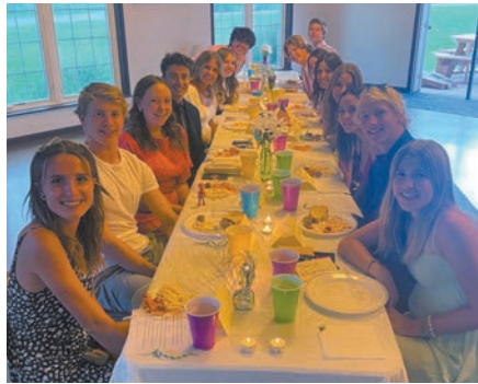
The 2022 lifeguard and guest services staff celebrate the 2022 pool season with a banquet.