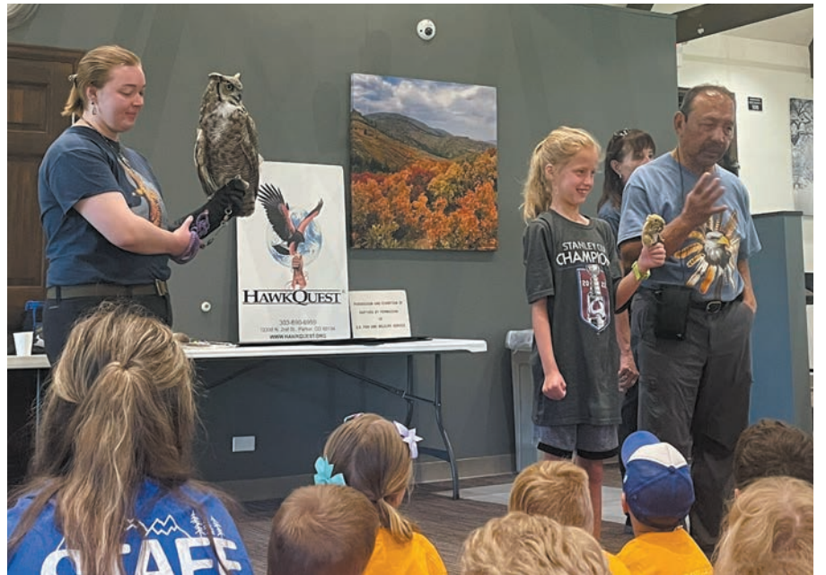
Campers enjoyed a visit and presentation from HawkQuest, where they got to interact with many birds of prey.