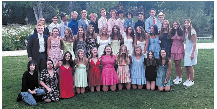
All dressed up! The 2022 lifeguard and guest services team traded pool attire for formal wear for their staff banquet to celebrate their hard work this summer.