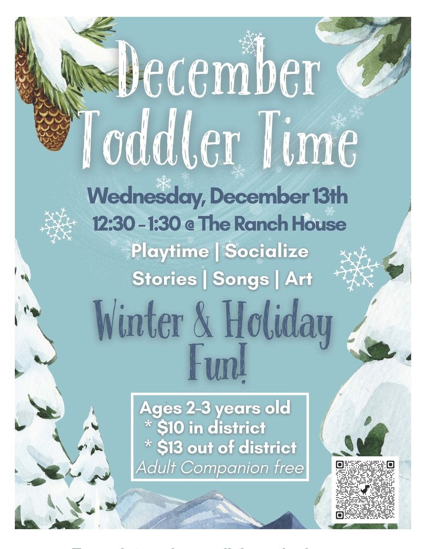
To register, please click on the image.