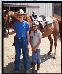
PICNIC WITH PONIES AGES 6 TO 8