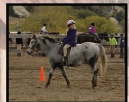
RIDING CAMP AGES 8+