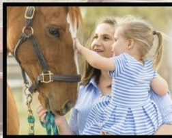
PICNIC WITH PONIES AGES 6 TO 8