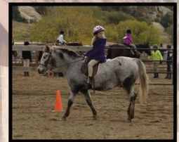
RIDING CAMP AGES 8+

For camp details, descriptions and to register, please click on the flyer.