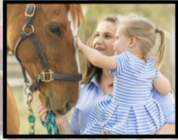
PICNIC WITH PONIES AGES 6 TO 8