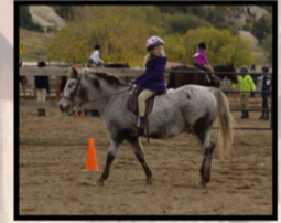
RIDING CAMP AGES 8+

For camp details, descriptions and to register, please click on the flyer.