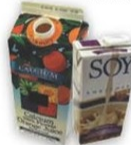
Paper milk/ juice cartons (no foil pouches, do not flatten)