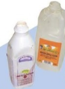
#1-7 Plastic Bottles